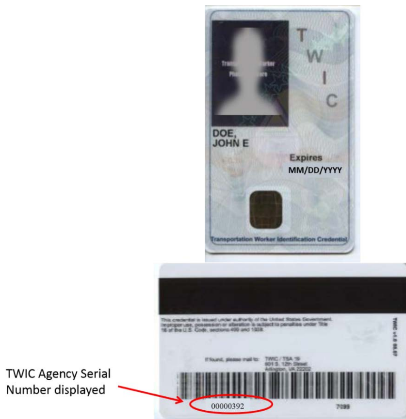
Figure 1: TWIC Agency Serial Number displayed on TWIC issued before May 2014

Using the example below, the number that would be input into the CSAT PSP application in the TWIC ASN data field is 00000392.